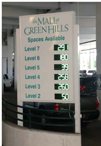
LED Spaces Available Signage (optional)