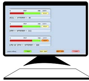
Console PC with PIMS Software – GUI