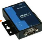
Network Interface Device